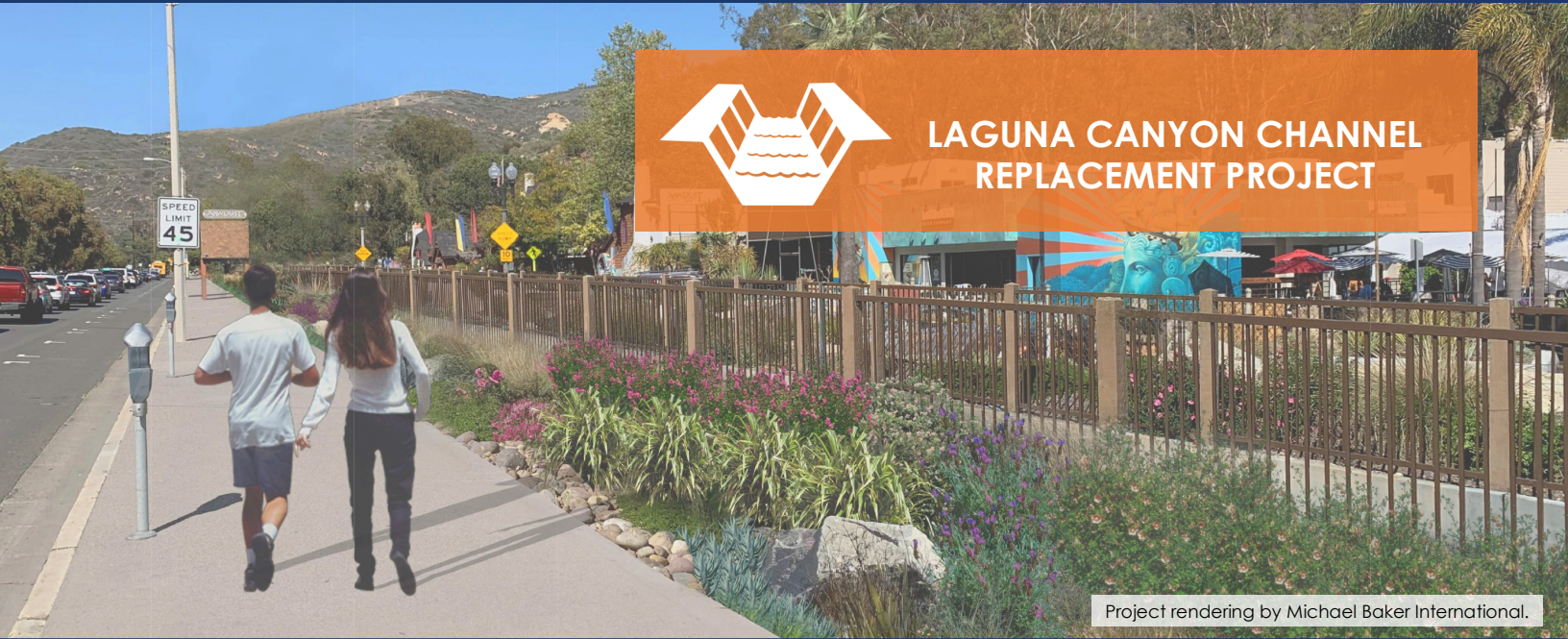
Project rendering by Michael Baker International.